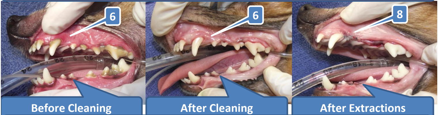
Pictures and dental x-rays are from an 8-year old Italian Greyhound. (left side of mouth)